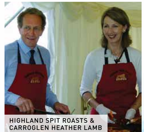
HIGHLAND SPIT ROASTS & CARROGLEN HEATHER LAMB