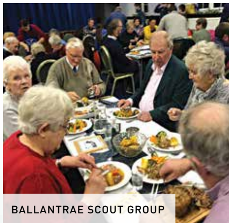
BALLANTRAE SCOUT GROUP