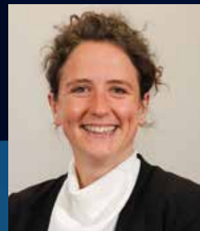
MAIRI GOUGEON MSP Cabinet Secretary for Rural Affairs and Islands

“ It was fantastic to see the support for the Scotch Lamb for St Andrews Day campaign last year. One of the highlights of the campaign saw 11,000 school children cooking with Scotch Lamb in Home Economics classes across Scottish schools. Scotch Lamb is the perfect match for St Andrew’s, and I would encourage everyone to build on last year’s campaign and support their local hill and upland farmers and crofters by cooking Scotch Lamb this year.”