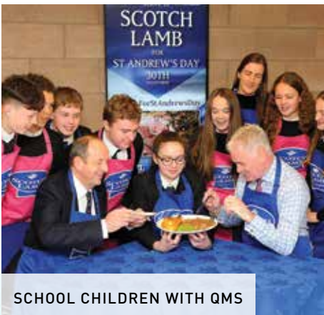
SCHOOL CHILDREN WITH QMS

• Hawick RFC v Musselburgh, St Andrews Lunch.