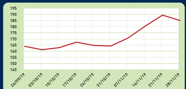
LAMB PRICE • GB AVERAGE LIVEWEIGHT (PPKG)

Average lamb prices increase over the campaign (SOURCE AHDB).