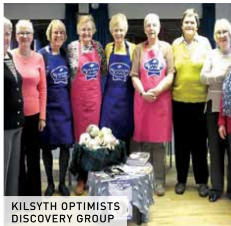
KILSYTH OPTIMISTS DISCOVERY GROUP